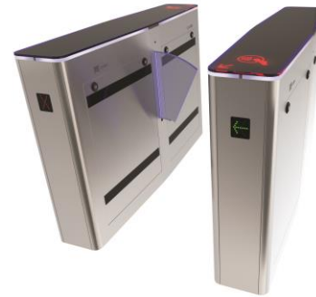
Speed Gates Turnstiles