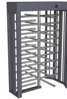
Full Height Turnstiles