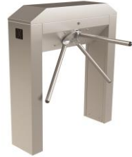
Classic line Double Leg Tripod Turnstile