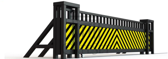
Sliding Vehicle Gates