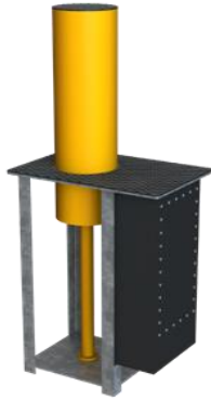
Traffic Regulator Hydraulic Rising Bollards