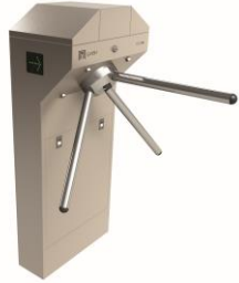
Classic line Single Leg Tripod Turnstile