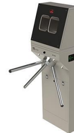
Special line Single Leg Hygiene Tripod Turnstile