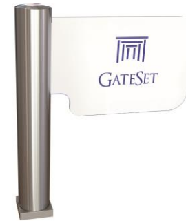
Exclusive line Glass Arm VIP Swing Gate