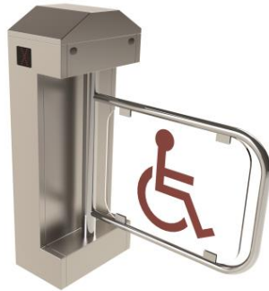
Motorized Swing Gate Turnstiles