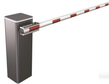
Rising Arm Barriers