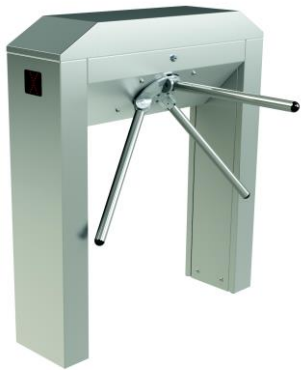
Waist Height Tripod Turnstiles

Click on Product Range Category to Navigate Directly