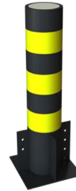
K12 Rated* Static Bollards