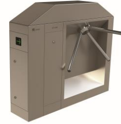
Busy line Single Leg Tripod Turnstile