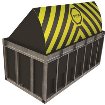
Hydraulic Road Blockers

Click on Product Range Category to Navigate Directly