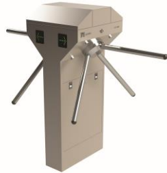
Classic line Single Leg Double Tripod Turnstile