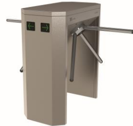
Classic line Double Leg Double Tripod Turnstile