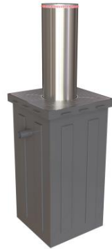
Automatic and Static Rising Bollards