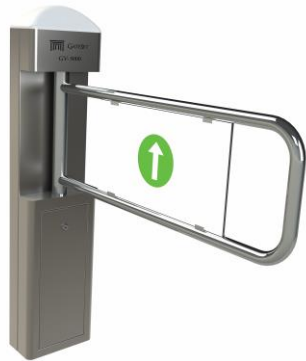
Classic line Motorized VIP Swing Gate